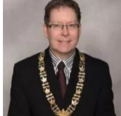
Mayor David Gillan City of North Battleford