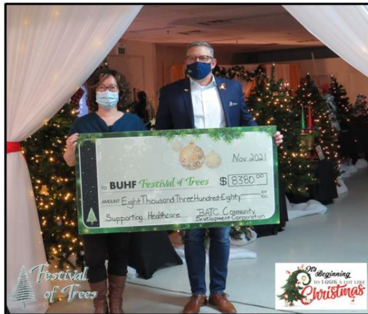
Battleford Union Hospital Foundation— Festival of Trees

Grant Recipients Total for 2021-2022 780,264.26