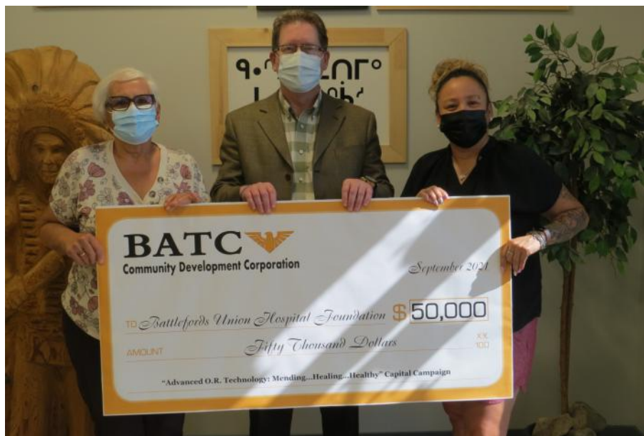
Battlefords Union Hospital Foundation - OR Capital Campaign