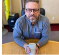
Mayor Ames Leslie Town of Battleford